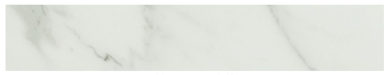
Calacatta Majore TrueScale™ MC

Laminex TrueScale is a celebration of scale and stone. In a market first, slabs of immense size have been reproduced and printed without repeat, down to the smallest detail.